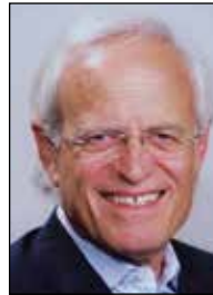
Martin Indyk UNITED STATES

First Deputy Prime Minister and Minister of Foreign Affairs. From 1982 to 1989, he was the Director of the Office of the Minister of Municipal Affairs and Agriculture. In July 1989, Al-Thani was appointed Minister of Municipal Affairs and Agriculture, and served as Deputy Minister of Electricity and Water for two years. He has also served as Chairman of the Qatar Electricity and Water Company, President of the Central Municipal Council, Director of the Special Emiri Projects Office, member of Qatar Petroleum Board of Directors, and member of the Supreme Council for Planning. Additionally, Al-Thani has held several other key positions, including member of the Supreme Defense Council, head of Qatar's Permanent Committee for the Support of al-Quds, member of the Permanent Constitution Committee, member of the Ruling Family Council, and member of the Supreme Council for the Investment of the Reserves of the State.