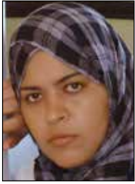
Dalia Ziada EGYPT

Dalia Ziada is the Executive Director of the Ibn Khaldun Center for Development Studies, one of the oldest nongovernmental organizations advocating for human rights and civil freedoms in the Arab world. Previously, Ziada worked for the American Islamic Congress for six years as the founding director of its Egypt Bureau. After Egypt's 2011 revolution, Ziada co-founded the El-Adl political party and ran for parliament. An Egyptian human rights activist, she was named by Newsweek in 2011 and 2012 as one of the World's Most Influential and Fearless Women, and one of CNN's 2012 Arab World's Eight Agents of Change, and was selected by The Daily Beast as one of world's Bravest Bloggers in 2011. She received the 2011 Tufts University Presidential Award for civil work and in 2010 was awarded the Anna Lindh Euro-Mediterranean Journalist Award. Ziada received her M.A. in International Relations from The Fletcher School of Law and Diplomacy, Tufts University.