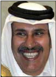
Hamad bin Jassim bin Jabr Al-Thani QATAR

Hamad bin Jassim bin Jabr Al-Thani is Prime Minister and Foreign Minister of the State of Qatar. Previously, he served as