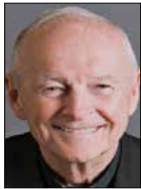
Theodore McCarrick UNITED STATES