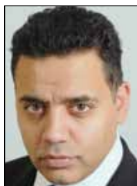
Shahid Malik UNITED KINGDOM

and the BBC World Service. His radio essay Faith and 9/11 broadcast on the 10th anniversary of the attacks was awarded second prize at the prestigious Sandford St Martin Awards for excellence in broadcasting about religion. Malik's BBC Radio 4 documentary Islam Without God , which explored the increasingly public discourse of disbelief among young Muslims, both in the east and in the west, was broadcast in February 2013.