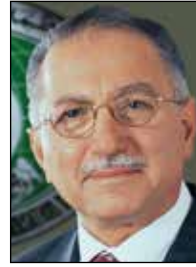
Ekmeleddin Ihsanoglu TURKEY