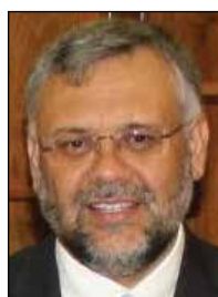
Ebrahim Rasool SOUTH AFRICA