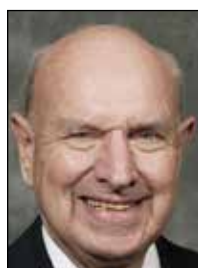
Thomas Pickering UNITED STATES