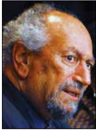
Saad Eddin Ibrahim EGYPT

Saad Eddin Ibrahim is the Founder and Head of the Ibn Khaldun Center for Development Studies in Cairo, and one of the leading pro-democracy activists in the Arab world. Ibrahim was recently