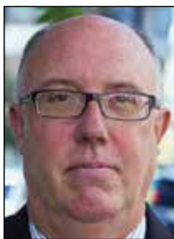
Bruce Riedel UNITED STATES