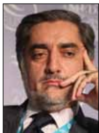
Abdullah Abdullah AFGHANISTAN