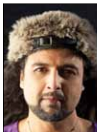
Salman Ahmad PAKISTAN