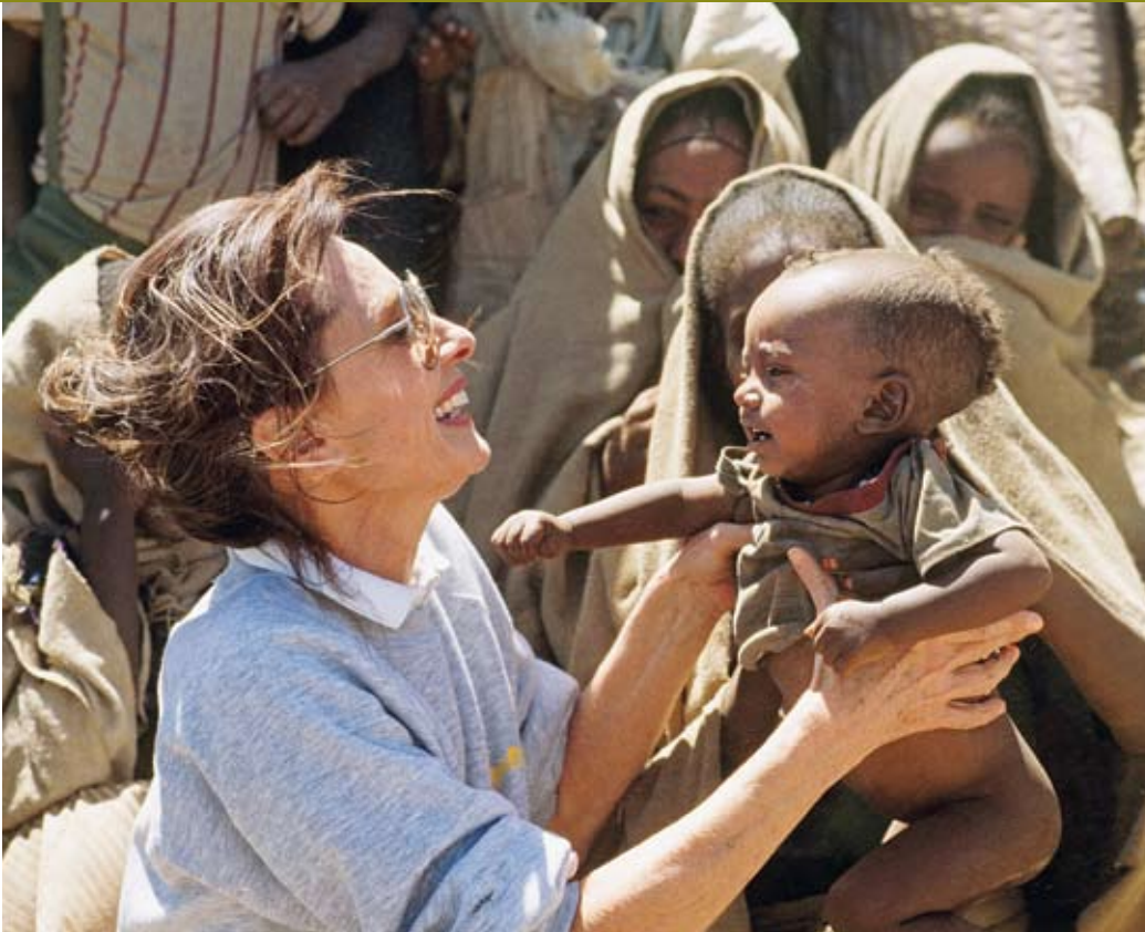
As a UNICEF ambassador, Audrey Hepburn traveled to Ethiopia where years of drought and civil strife caused widespread famine in 1989.

and raise their game. In 1997, the new U.K. government of Tony Blair created a cabinet-level Department for International Development (DFID) with an exclusive and resolute focus on poverty reduction, fulfilling a campaign promise strongly supported by influential anti-poverty groups. In 2003, U.S. president George W. Bush announced the creation of the $15 billion President's Emergency Plan for AIDS Relief, winning the support of a powerful coalition of HIV/AIDS advocacy groups. For their part, the World Bank and the International Finance Corporation are increasingly pursuing cross-sector partnerships, as evinced by their Lighting Africa Initiative, which seeks to create the market conditions needed for the supply and distribution of "green" lighting products to the 250 million people in Sub-Saharan Africa who currently have no access to electricity. Meanwhile, iconic private foundations like the Rockefeller Foundation, which in its early years spent more on foreign aid than the U.S. government, are now reorienting themselves to better leverage their intellectual and financial assets—for instance, through collaboration with the powerful newcomer the Gates Foundation.