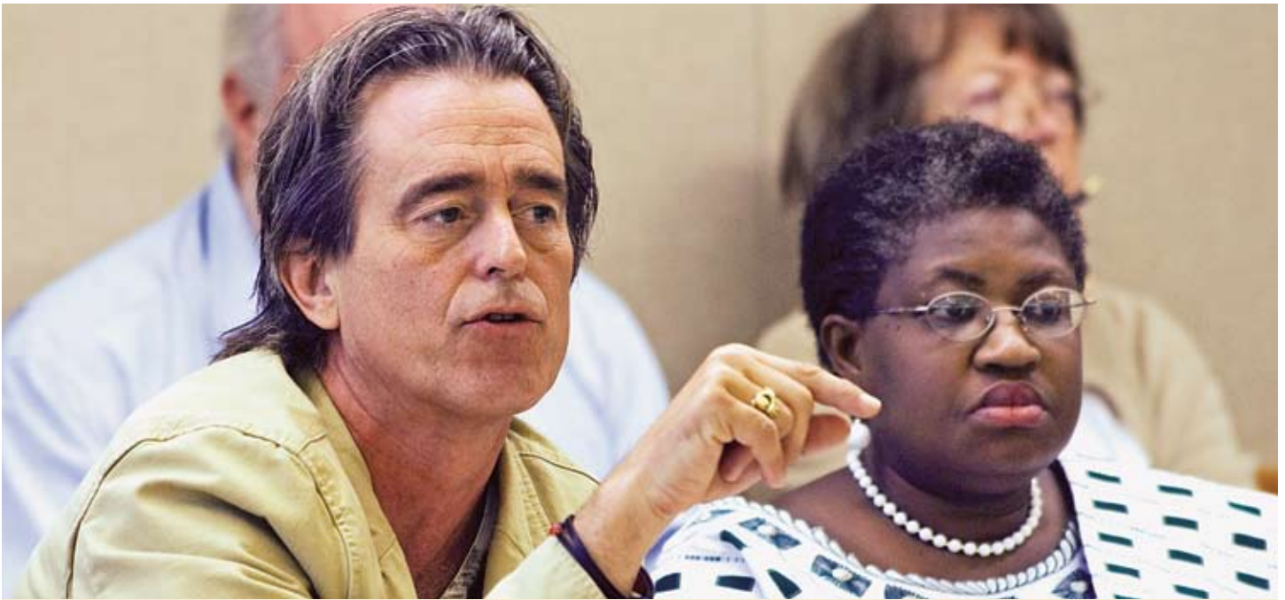
Bobby Shriver ( Cofounder of (PRODUCT) RED ) and Ngozi Okonjo-Iweala ( Managing Director of the World Bank )