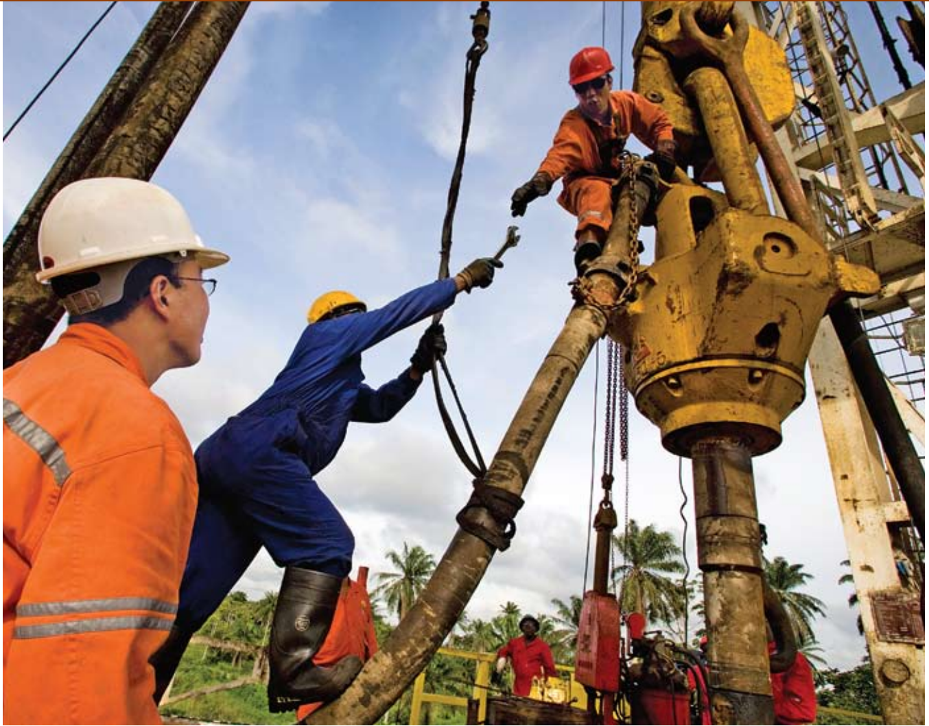
Chinese contractors drilling for oil in the Niger Delta.

more tempting it is for recipients to “donor shop” to avoid the strictures of conditionality and selectivity associated with mechanisms such as the MCC and the World Bank’s performance-based allocation system.