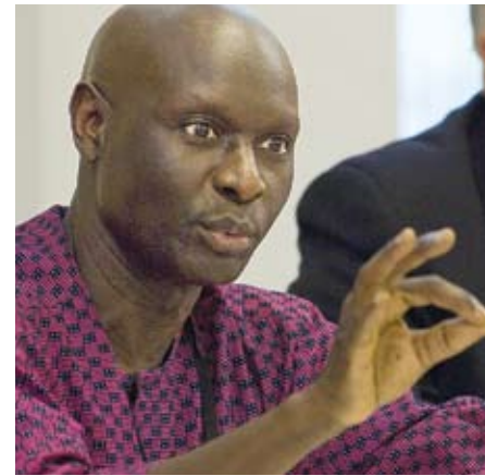
Figure 2. Forging New Partnerships and Alliances

President, LBL Foundation for Children; Former United Nations Undersecretary General and Special Representative for Children and Armed Conflict